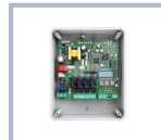
ONE.4WB 4-channel receiver with wide range power supply (115-230 Vac/dc) and triple coding: Advanced Rolling Code, Rolling Code and Fixed code. 512 memorisable codes.

AUTOMATISMI BENINCA SpA • Via del Capitello, 45 • 36066 Sandrigo (VI) ITALY • T +39 0444 751030 • sales@beninca.com