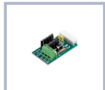
DA.RB Battery charger card for DA.S04.