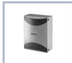
LB Standard box for control units. Protection level IP55. (290 x 220 x 118 mm).