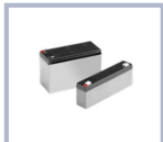
DA.BT2 2,1Ah 12 Vdc Battery.